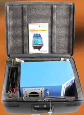
Multi-Hole Insertion Tube